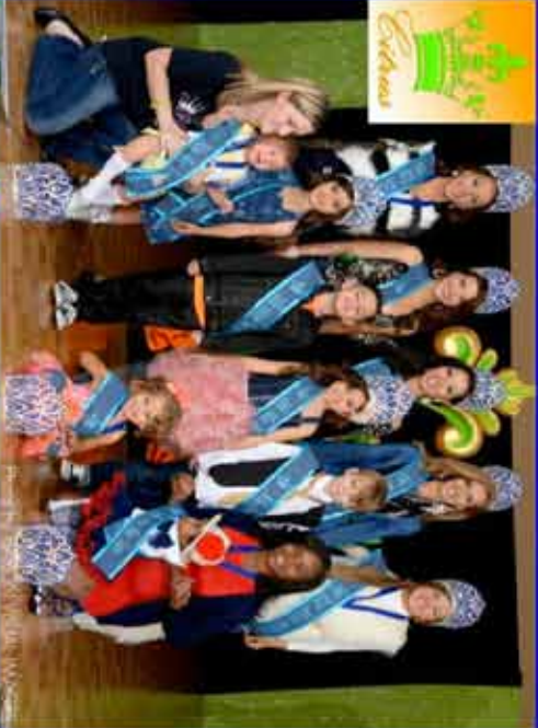
Forever in Blue Jeans 10-12 13-15 16-19 20-24 30+ 7-up Boys